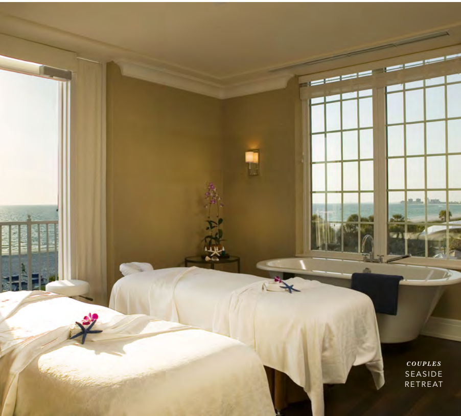
COUPLES SEASIDE RETREAT